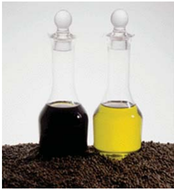
Hemp is Nutritious & Delicious

detrimental to our blood cholesterol balance. To avoid conversion of polyunsaturated fatty acids to unhealthy peroxides at higher temperatures, hemp oil and nut are best used for cold and warm dishes where temperature is kept below the boiling point (212° F). Hemp oil should not be used for frying. When using it for light sautéing, keeping the pan at low heat and with sufficient moisture in the bottom limits both temperature and the formation of peroxides and off-flavors. Hemp nut can be lightly toasted and baked in bread and pastry dough keeping in mind these temperature and moisture caveats.